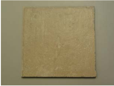
Table 8. Pictures of The Tested Specimen